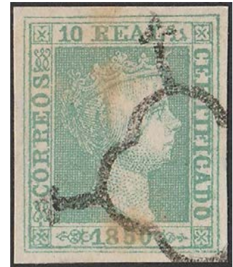
Sperati Forgery of Sc#5