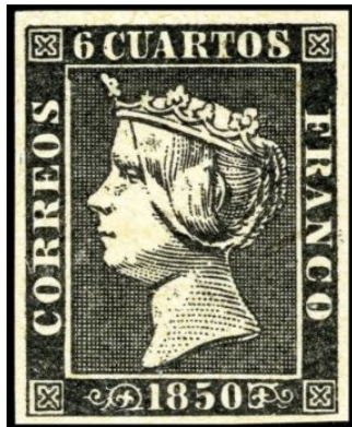
Segui Forgery of Sc#1