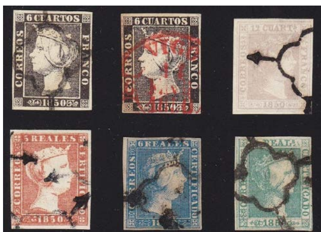
Top row: 6c Sc#1 (plate 1), 6c Sc#1 (plate 2), 12c Sc#2 Bottom row: 5r Sc#3, 6r Sc#4, 10r Sc#5