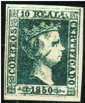
Crude Forgery of Sc#5