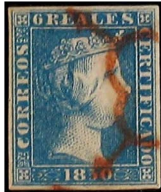
Sperati Forgery of Sc#4