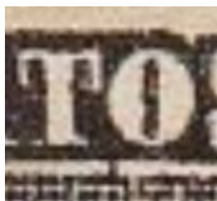
6c Plate I (T & O separate)