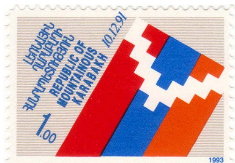
#1: the flag of Nagorno-Karabakh

On two dealer websites (as well as eBay), I found what is listed in Michel as #1-3 along with a set of souvenir sheets listed as #4 with some sub-lettering for perf vs. imperf and with control number (for international stamp market) and without control number (for local distribution). They are listed with an issue date of November 6, 1993.