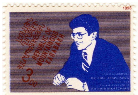
#2: Arthur Mkrtchyan the first Chairman of the Supreme Council elected Jan 1, 1992, but assassinated April 14, 1992