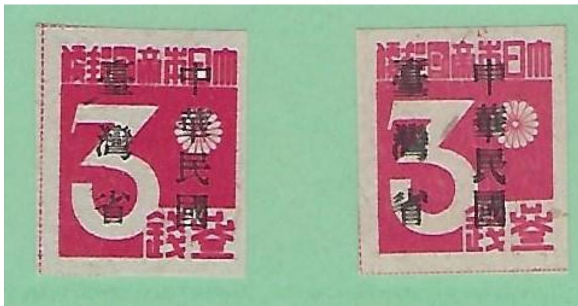
Stamp at far left is Sc#1 (250%) with normal overprint.

Once I examined it further, I realized it was the same overprint offset slightly lower. I returned to Scott where I found a listing for Scott #3 with an inverted overprint (#3a) and double overprint (#3b). There were no additional listings for Scott #1. Now the search was on. What did I have?