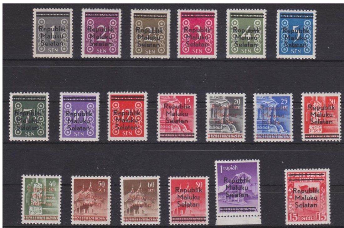
Set of South Moluccas first issue: Zbl #1-18, 24 (SG #1-17 with two additional denominations) [80%]