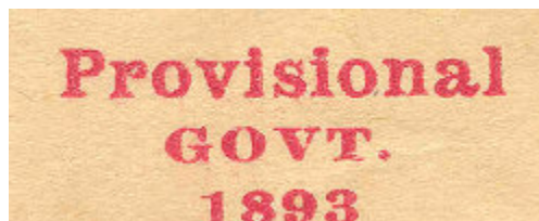
#53, the first issue of the Government.