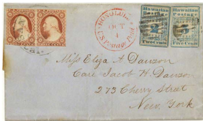
Image at right: Scott #1 and #2 on cover. This is the only known cover with Scott #1. It sold for $1.9 million in the 1995 Honolulu Advertiser Collection auction. The 7 cents in Hawaiian postage paid the local rate (5 cents) and the boat captain (2 cents). The six cents US postage paid for the trip from San Francisco to New York.

By the mid to late 1800s, the influence of Americans and Europeans on the islands had increased. The children of the original missionaries became influential business men and government officials. They slowly removed power from the king. This included the Bayonet Constitution signed by King Kalākaua in 1887 which moved most of the power to the legislature and cabinet.