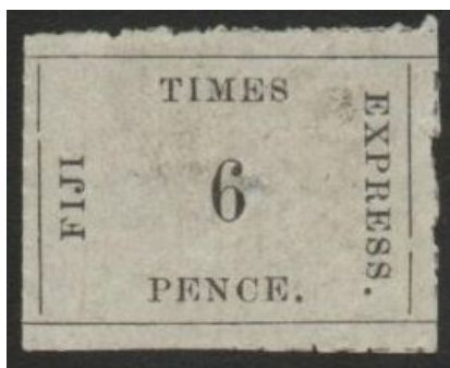
1888 Reprint (200%)