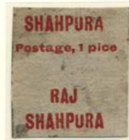
Only known unused copy

The 1917 1 pice carmine was typographed on drab wove paper. The stamps were issued imperforate.