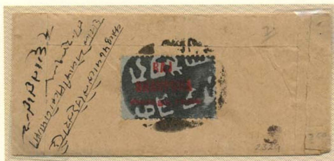
Ordinary notice cover posted on 24 Jan 1915 to Shahpura City, stamp tied by two line two line intaglio seal (Jaiswal type 3)

The 1914 1 pice carmine was typographed on bluish grey wove paper. The stamps were perforated 11 on 2 or more sides.