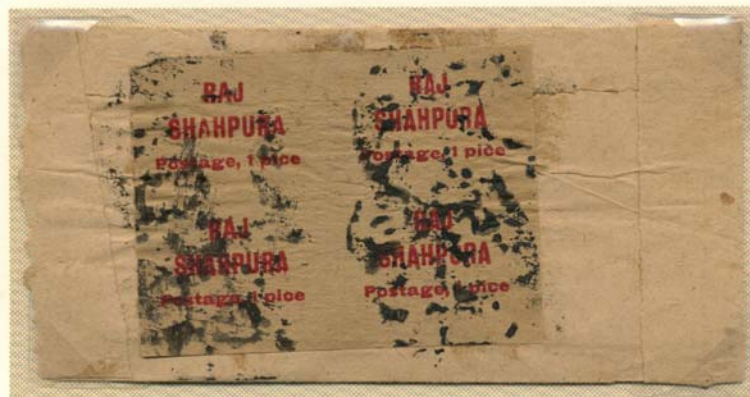
Registered cover with contents from Shahpura City to Partabpura dated 4 March 1917, stamp tied by three line intaglio seal (Jaiswal type 4) -ex Staal

One of three known covers bearing the 1917 1 pice carmine on drab adhesive