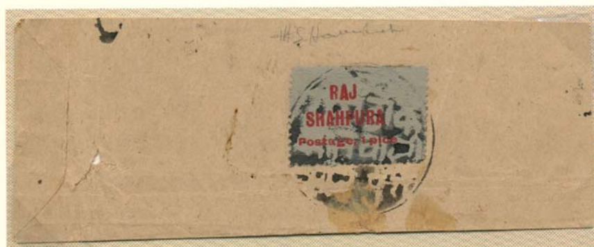
Ordinary cover to Shahpura City, stamp tied by three line intaglio seal (Jaiswal type 4) -ex Haverbeck and Staal

One of seven known covers bearing the 1914 1 pice carmine on bluish grey adhesive